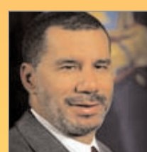
SPECIAL GUEST NY State Lieut. Governor DAVID PATTERSON